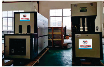
BOTTLE BLOWING MACHINE