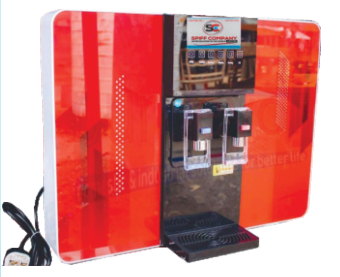
DOMESTIC RO DSPENSER