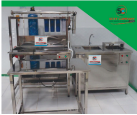
PURE WATER SYSTEM COMPLETE SETUP