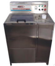
BRUSH BOTTLE RINSER