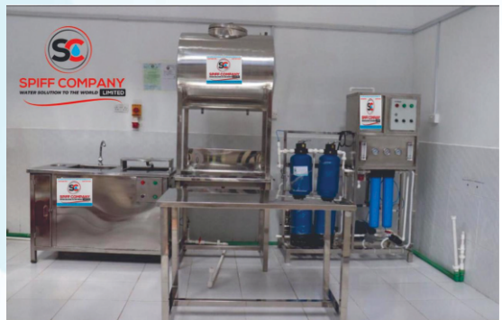
REVERSE OSMOSIS 250LPH COMPLETE SET UP