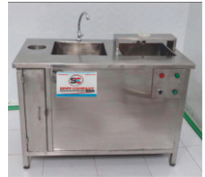
JET BOTTLE RINSER